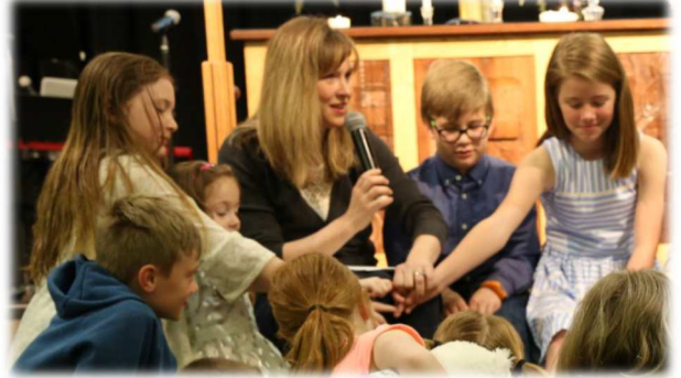
A recent "Time For Young People" was all about praying for our youth & blessing their mission trip this June.