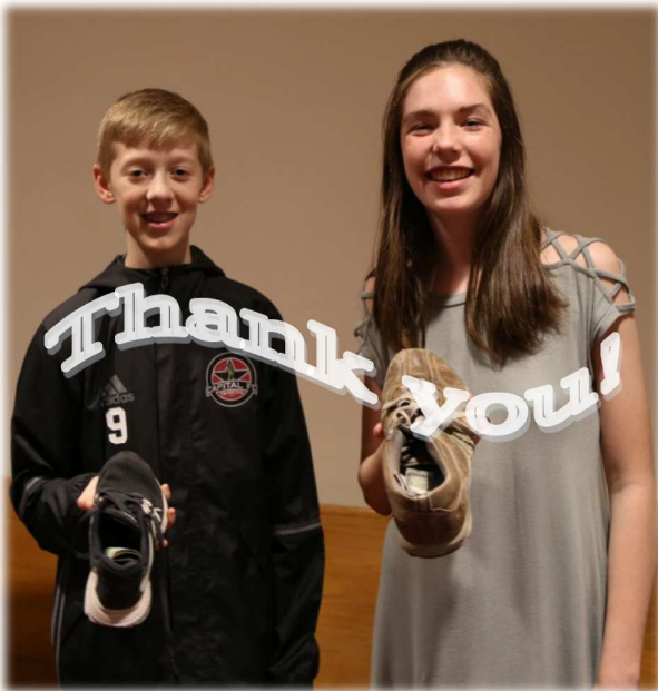
The Youth Sunday "Fill-the-Shoe" was a success! Thank You for all your support!