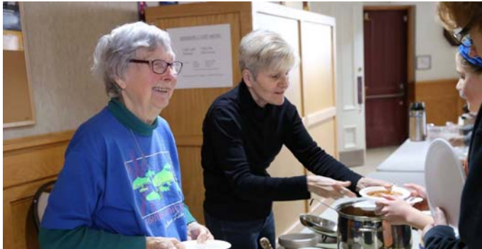
A BIG thank you also to the volunteers who prepare lunch to make sure all of the teams are fed before heading out to work.

Saturdays of Service are First United Methodist Church's quarterly service events, providing opportunities to work alongside local agencies making a positive impact in our community.