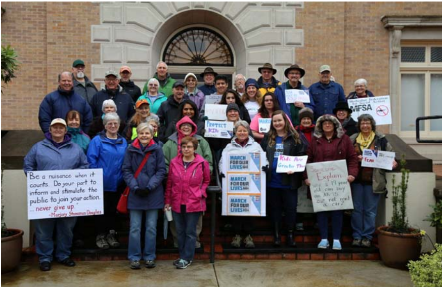
Open Door Churches March for Our Lives, on March 24